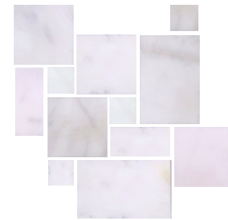
French Pattern 30mm