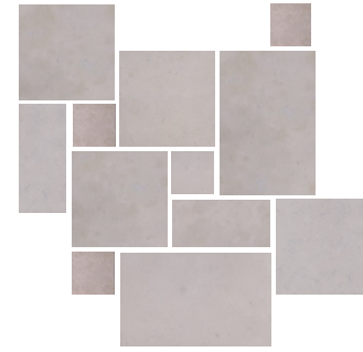
French Pattern 30mm