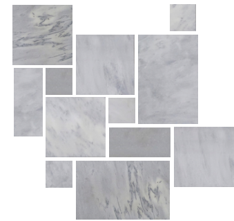
French Pattern 30mm